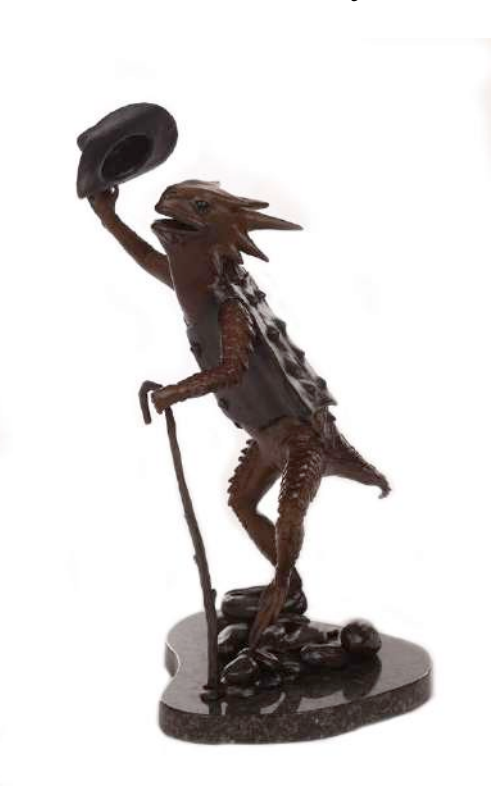
418. Douglas Clark (Am. 20/21st Cent.) Old Rip, ed. 4/20 bronze 23 1/2 x 12 x 13 signed across bottom: Douglas Clark © 4/20 $7,000 - $9,000