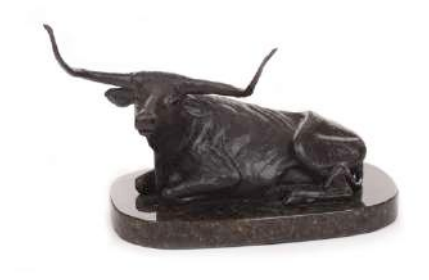
419. Douglas Clark (Am. 20/21st Cent.) Half Time, ed. 3/25 bronze 9 1/4 x 15 x 7 1/2 signed across bottom: Douglas B. Clark, © 3/25 $1,800 - $2,400