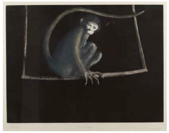
74. Julio Larraz (Am. Bn. 1944-) Mandragola, ed. State Proof etching 23 3/4 x 31 1/2 signed across bottom: State proof, Mandragola, Larraz $2,000 - $4,000