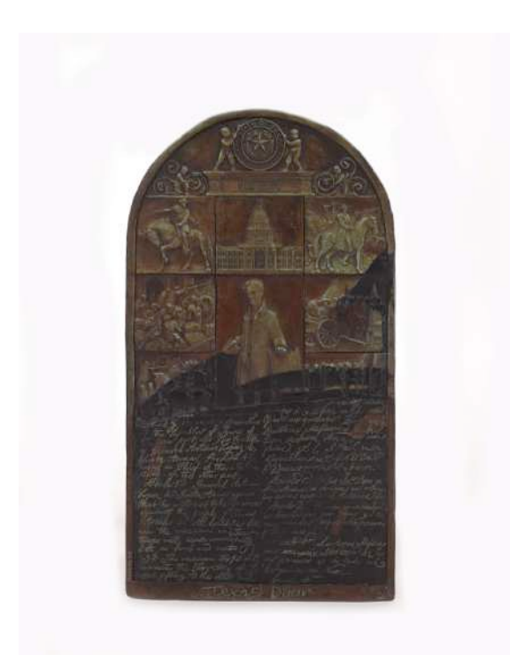
268. Miguel Zapata (Sp. Bn. 1940-) Texas Door, 2002 bronze 20 3/4 x 11 1/2 signed lower left: Zapata 02, P/A $4,000 - $8,000