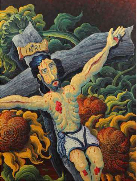
304. Kim Douglas Wiggins (Am. Bn. 1960-) Sangre de Cristo, 1994 oil on canvas 48 x 36 signed lower right: KD Wiggins 94 $10,000 - $15,000