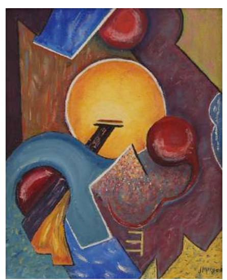
426. Janet Moyer (Am. 20th Cent.) Abstraction, No. 1 oil on artists' board 11 x 9 signed lower right: J. Moyer $400 - $800