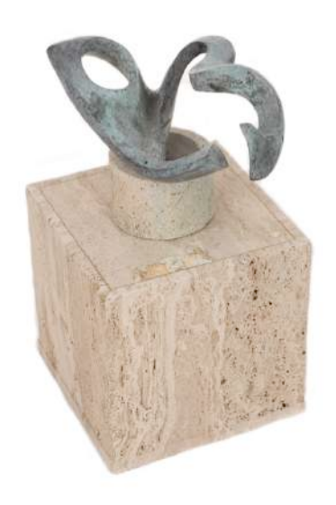
318. Michael Cunningham (Am. 20th Cent.) Untitled - Biomorphic Form bronze on stone base 23 1/2 x 14 x 12 $2,500 - $5,000