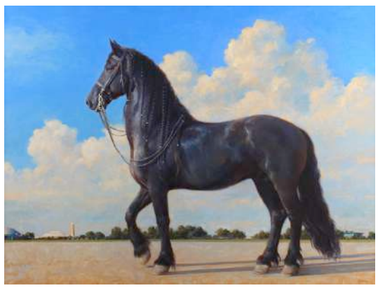
300. James Tennison (Am. Bn. 1955-) The Friesian, 2012 oil on canvas 36 x 48 signed lower right: Tennison $10,000 - $20,000