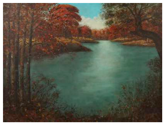
442. Ruby Willess Wampler (Am. 20th Cent.) Turtle Creek in the Fall, 1972 oil on canvas 30 x 40 signed lower right: Ruby Willess Wampler - 72 $1,500 - $3,000