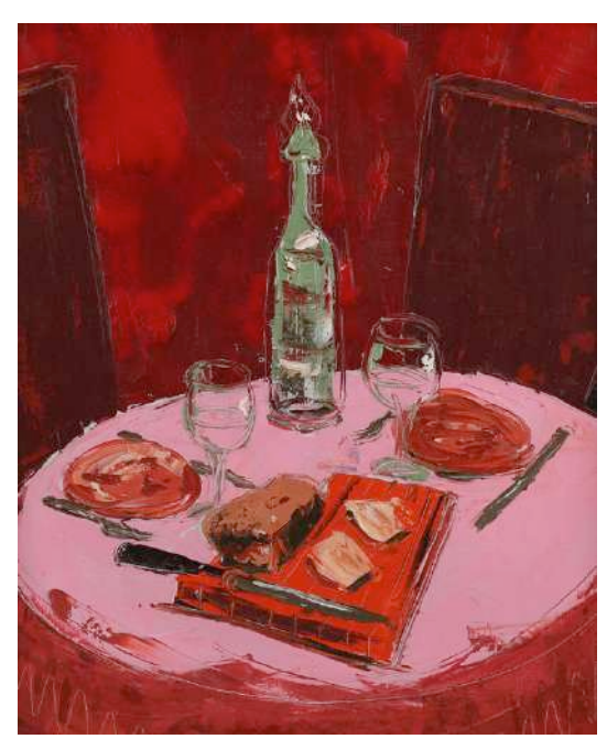
459. James Fromme (Am. 20th Cent.) Still Life oil on canvas 24 x 20 $800 - $1,200