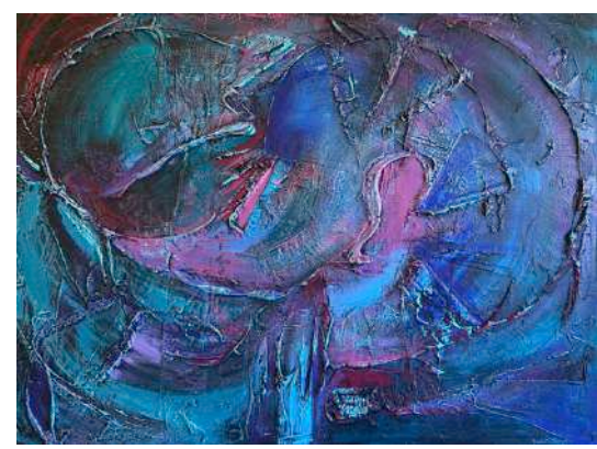
424. Judith Seay (Am. 20th/21st Cent.) Wrestling Angels, 1991 oil and mixed media on canvas 35 1/2 x 48 signed lower right: Judith Seay '91 $4,000 - $6,000