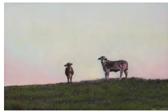
417. Anne C. Weary (Am. Bn. 1952-) Charolais Cattle at Dusk pastel on paper 8 1/2 x 12 3/4 signed lower right: Anne C. Weary $400 - $800