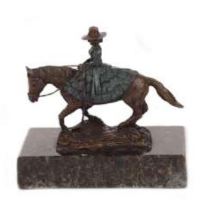
420. Douglas Clark (Am. 20/21st Cent.) Escaramuza, ed. 4/50 bronze 5 1/2 x 5 8/9 x 2 3/4 signed across bottom: Douglas Clark, 4/50 © $400 - $700