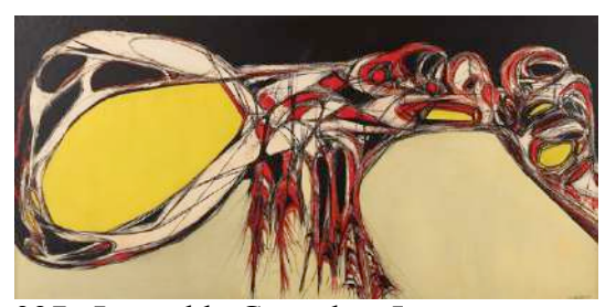
327. Leopoldo Gonzalez, Jr. (Am. Bn. 1921-) Fire Ant, 1958 oil on board 23 x 46 signed lower right: Leopoldo-58 $4,000 - $6,000