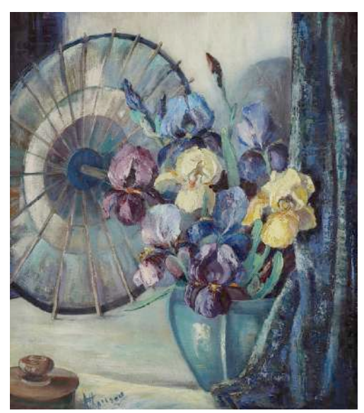
374. Adele Thomason (Am. 20th Cent.) Iris oil on canvas 26 x 23 signed lower left: A. Thomason $800 - $1,200