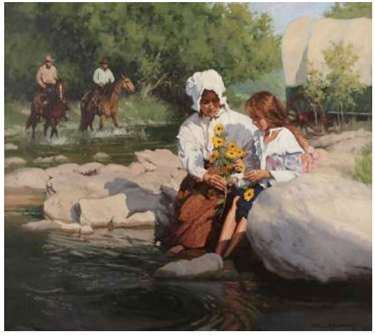
275. Bruce R. Greene (Am. Bn. 1953-) Trailside Treasures, 1997 oil on canvas 36 x 40 signed lower right: Bruce R. Greene, CA, © $6,000 - $12,000