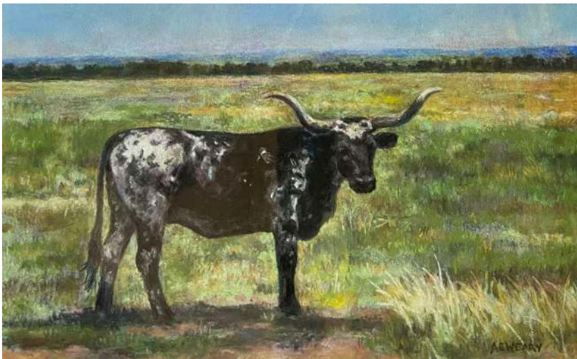
Anne Weary (SOLD) (Am. b. 1952) Longhorn pastel on paper 6 x 9 1/2 signed lower right: AC Weary