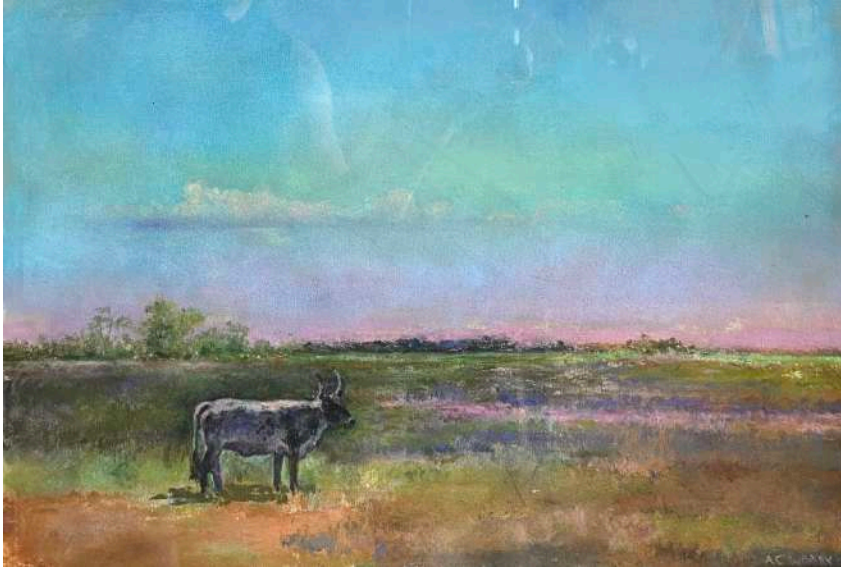
Anne Weary (SOLD) (Am. b. 1952) Longhorn in Pasture pastel on paper 8 x 12 signed lower right: AC Weary