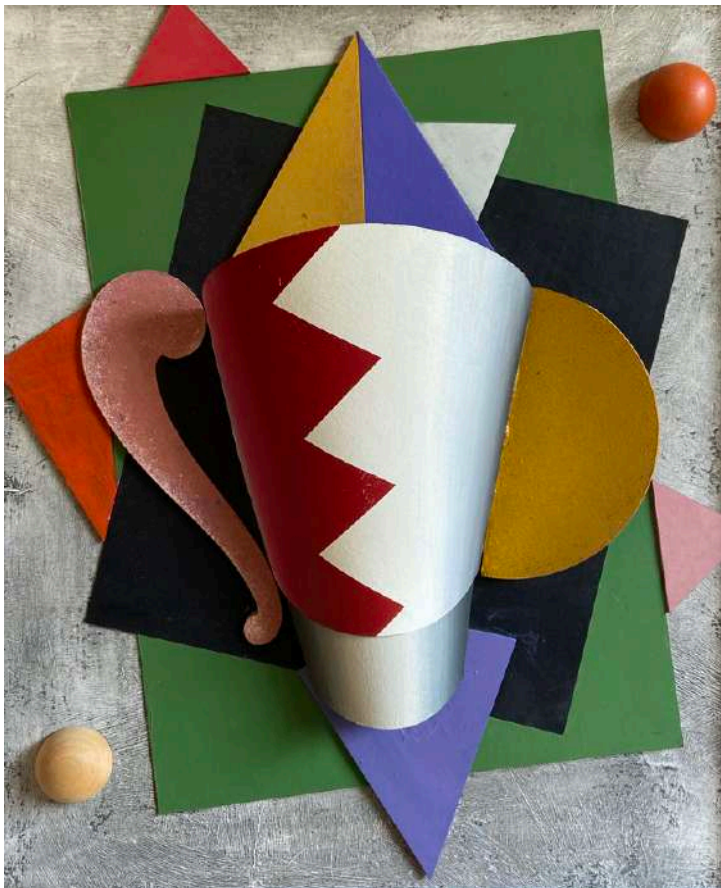
Dan Rizzie (SOLD) (Am. b. 1951) Maquette I for Monumental wall-mounted sculpture oil on wood 23 ½ x 20 x 3 ½ signed verso: Dan Rizzie 1994