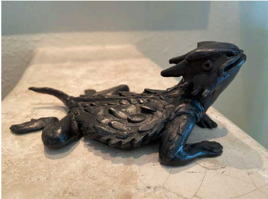
Douglas Clark (On HOLD) (Am. 20 th -21 st Cent) Horned Pride bronze 3 ½ x 6 x 2 ½