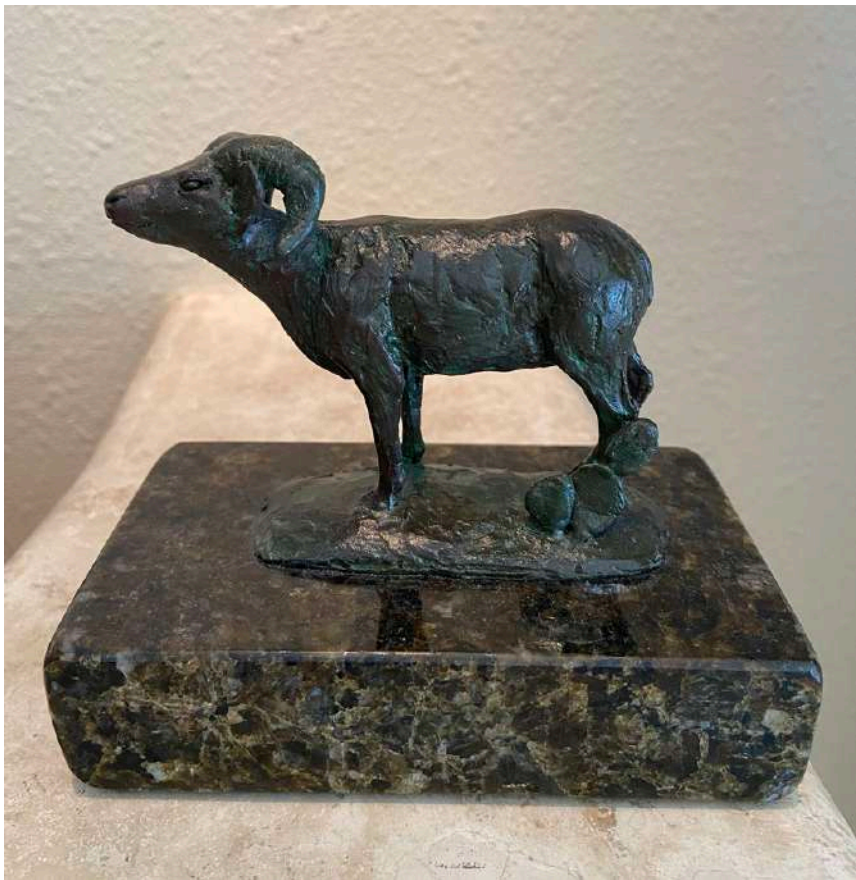
Douglas Clark (Am. 20 th -21 st Cent) Miniature Big Horn bronze 3 ¼ x 4 x 1 ¾ signed on base: Douglas Clark $350