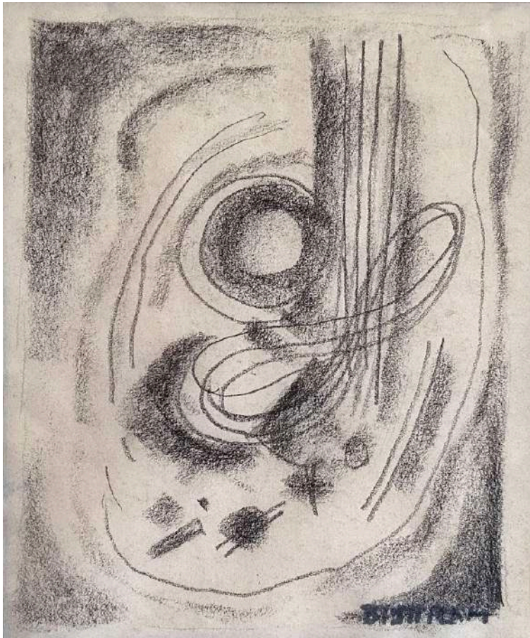
Emil Bisttram (Am. 1895 – 1976) Abstraction pencil on paper 4 \frac{3}{4} x 4 signed lower right: Bisttram $850