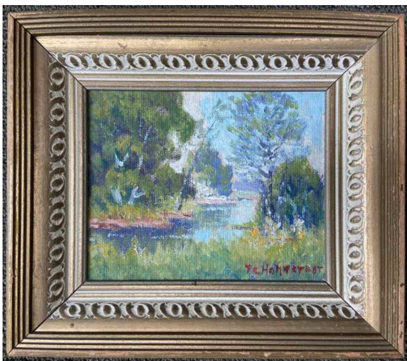
Peter Hohnstedt (SOLD) (Am. 1871 – 1957) Landscape Scene oil on canvasboard 4 ¼ x 5 ¼ signed lower right: PL Hohnstedt