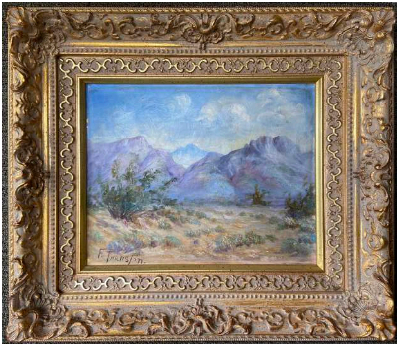
Fannie Palmer Thurston (SOLD) (Am. 1870 – 1956) El Paso Landscape oil on board 8 x 10 signed lower left: F Thurston $1,000