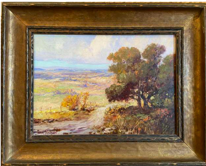
Franz Strahalm (SOLD) (Am. 1879 – 1935) A Texas Landscape, c. 1920's oil on board 9.5 x 13.75 signed lower left: Franz Strahalm