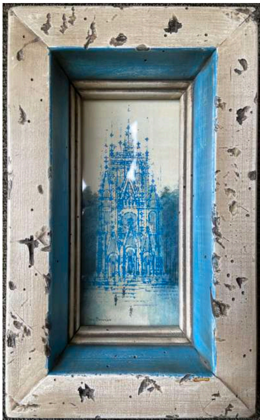
David Brownlow (SOLD) (Am. 1915 – 2008) Cathedral watercolor on paper 6 ½ x 3 signed lower left: David Brownlow $300