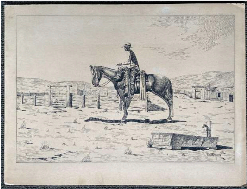
Billy Earnest (SOLD) Cowboy on Horseback , 1940 ink on stock paper 12 3 / 4 x 18 1 / 2 signed lower right: Billy Earnest 1940 $750 for Pair