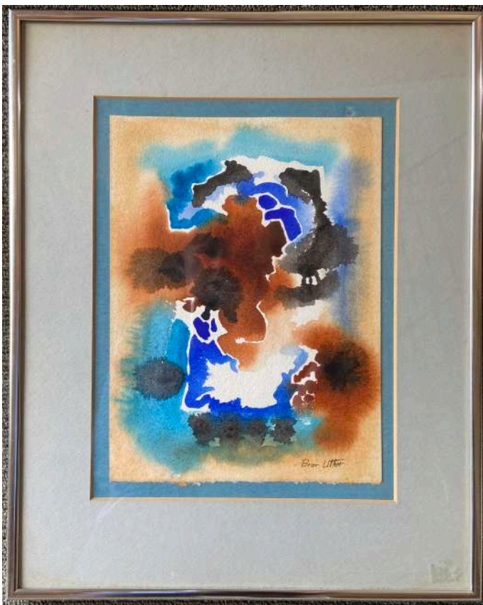
Bror Utter (SOLD) (Am. 1913 – 1993) All Things Have but One Suchness , 1979 watercolor on paper 9 ½ x 7 signed lower right: Bror Utter $750