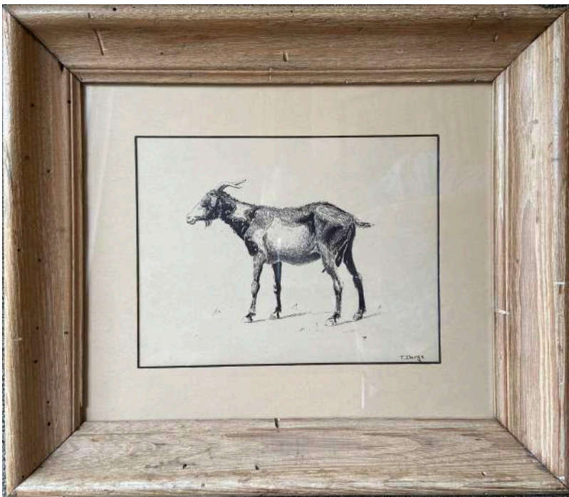
Fred Darge (SOLD) (Am. 1900 – 1979) Goat pen and ink on paper 8 x 10 signed lower right: F Darge $550