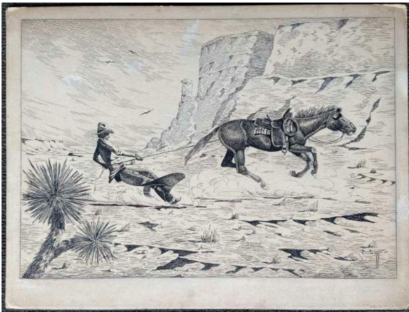
Billy Earnest (SOLD) Horse Roping , 1940 ink on stock paper 12 3 / 4 x 18 1 / 2 signed lower right: Billy Earnest 1940