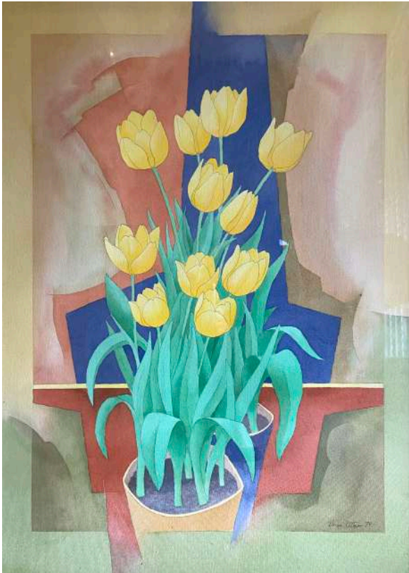
Bror Utter (Am. 1913 – 1993) Tulips , 1974 watercolor on paper 30 x 22 signed lower right: Bror Utter 74 $2,200