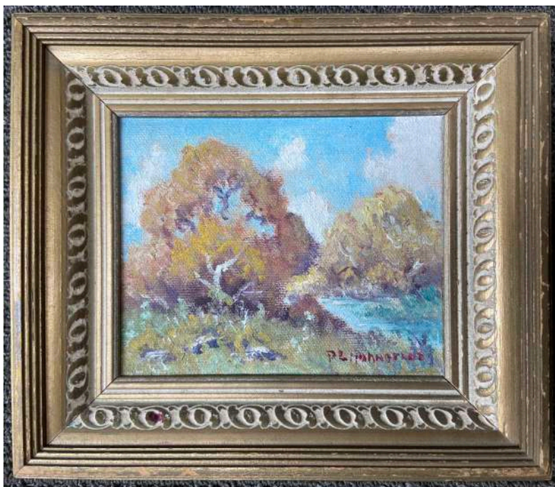
Peter Hohnstedt (SOLD) (Am. 1871 – 1957) Fall Landscape oil on canvasboard 4 ¼ x 5 ¼ signed lower right: PL Hohnstedt $300 for Pair