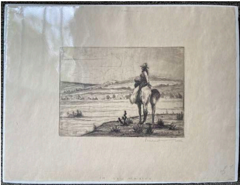
Bernhardt Wall (Am. 1872 – 1956) In New Mexico etching 5 x 6 \frac{3}{4} signed lower right: Bernhardt Wall $350