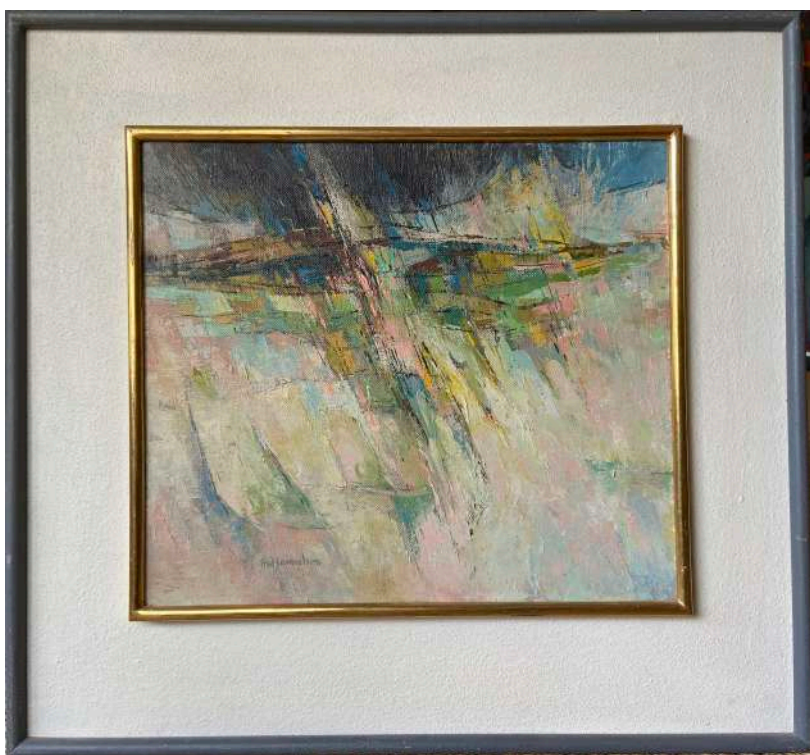
Fred Samuelson (Am. 1925 – 2015) Spring Rain oil on canvas 12 x 16 signed lower left: Fred Samuelson $1,200