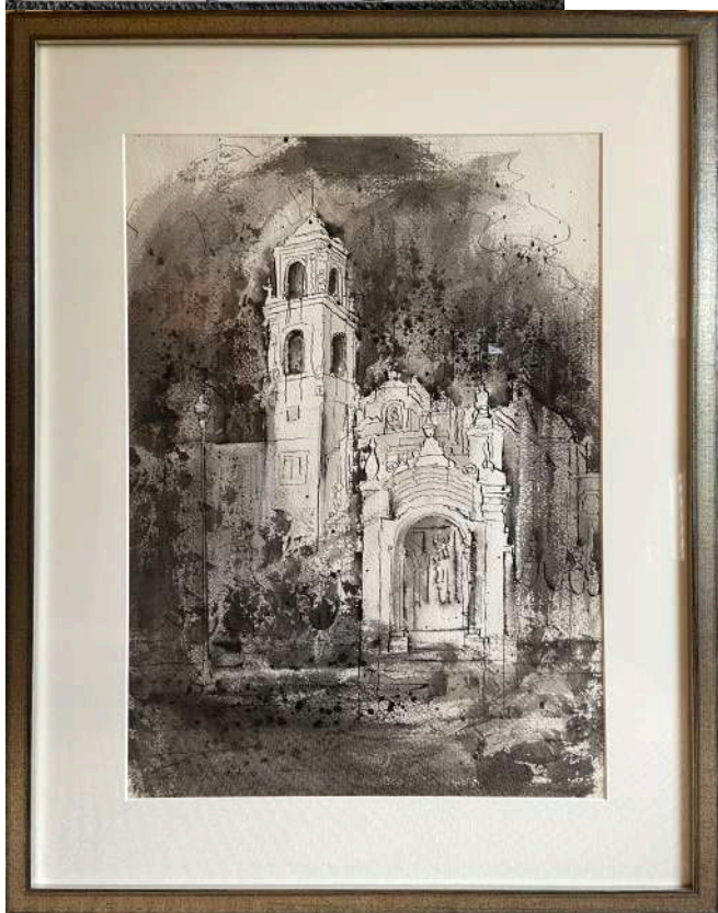
David Brownlow (SOLD) (Am. 1915 – 2008) Cathedral, San Miguel de Allende watercolor on paper 20 x 14 signed lower left: David Brownlow $650