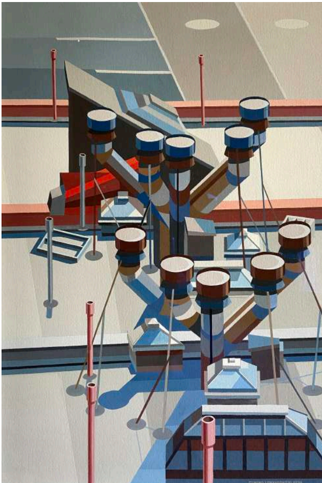
Edmund D. Lewandowski (SOLD) (Am. 1914 – 1998) Rooftops , 1994 gouache on paper 25 ½ x 17 ½ signed lower right: Edmund Lewandowski 1994