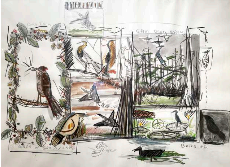
David Bates (SOLD) (Am. 1952 - ) Birds of Grassy Lake , 1986 charcoal, guache & pastel on paper 26 x 36 signed lower right: Bates 86