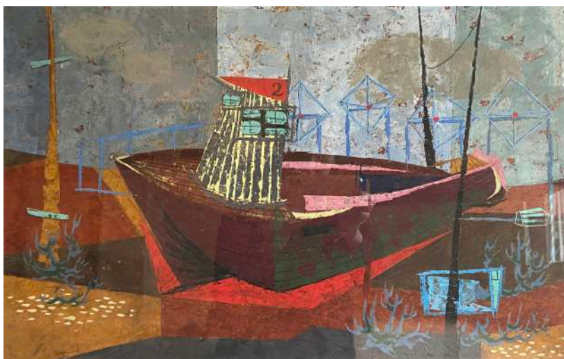
Mabel Pearl Frazer (SOLD) (Am. 1887 – 1981) The Old Shrimper mixed media on paper 14 x 21 ½ signed lower left: Frazer $1,500